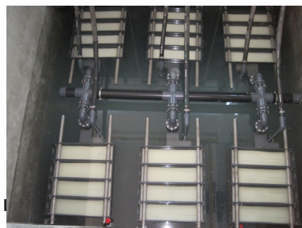
BIO-CEL ® 400 Modules Installed